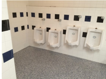
Boys' restroom near the big gym. New tile, fixtures, & epoxy floor.

The annual fire inspection brought up a few issues that needed attention. The old fire alarm system has now been replaced with a low-voltage system with