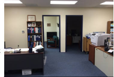
New office area for elementary and district offices.

The contractors have been hard at work all summer in order to be ready for students to return to an improved building in August.